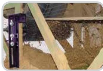
2" (50mm) rubber fingers gently dislodge carryback from chevron or raised ribs

Chevron, cleated and raised rib belts present a special problem for efficient cleaning. However, not cleaning these belts lets the carryback move along the return belt and cause all the familiar problems: mistracking, buildup and premature wear on idler rollers and resulting belt wear and damage. Flexco's Chevron Belt Cleaner takes a new approach to cleaning these problem belts.